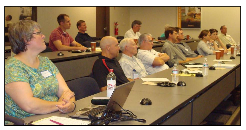
The OAFP Annual Summer Conference and Tour included presentations from Hobart Corporation.